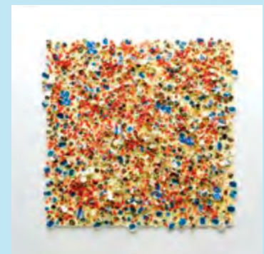
The art of Howardena Pindell

The MWC is a privately owned, publicly shared collection of art. The majority of the collection is by African American artists supplemented by works from artists of the African diaspora or works which reflect upon it.